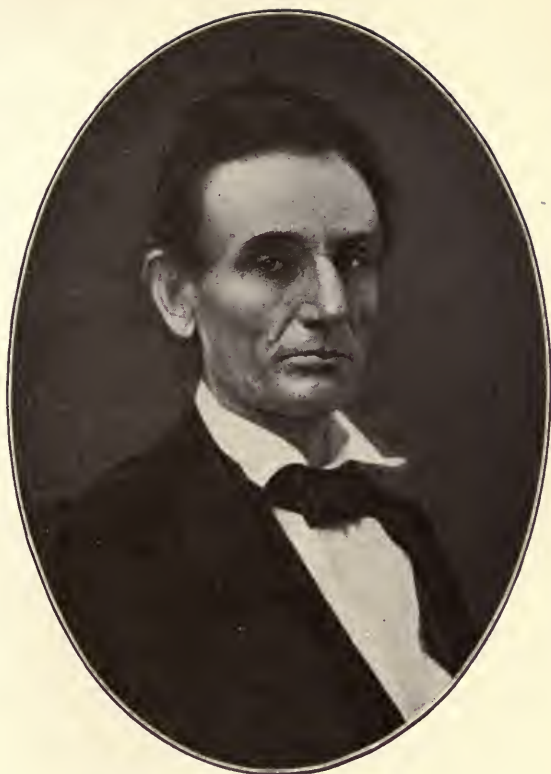
Lincoln as President-Elect, 1860